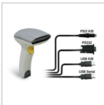
Cable replacement solution for Legacy Output (PS/2 keyboard, RS 232, USB keyboard and USB Serial )