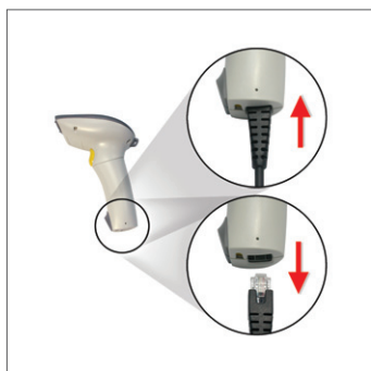
User replaceable interface cable converter to use with various host machines