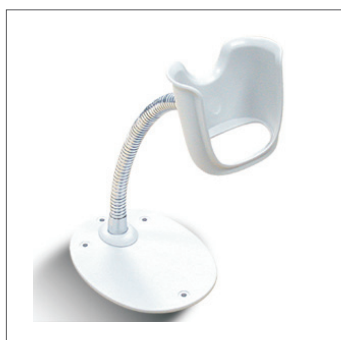
Elegant Optional Hand-Free Stand for Counter Top Application