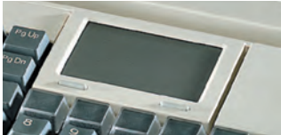
MCI 128 Row & Column