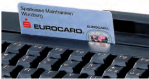
MCI 128 Alpha