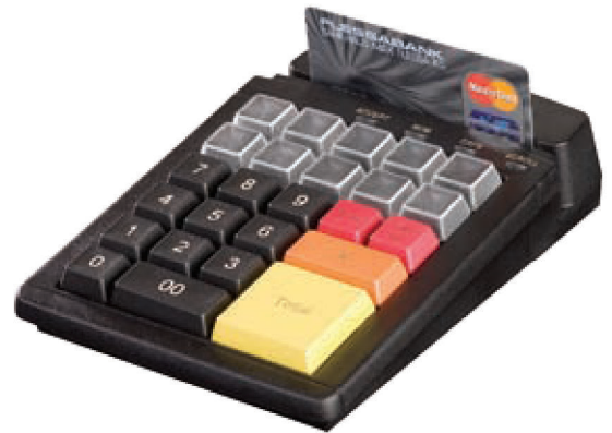
MCI 30 with MSR and Customized color keys

Ideal for high volume scanning operations where the keyboard is used primarily for tendering and PLUs. Use of double and quad keys makes this a very intuitive, uncluttered design for both new and experienced cashiers.